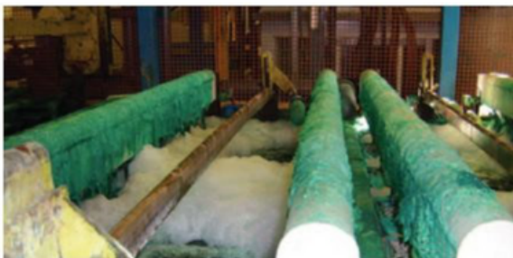
Air agitation showing foam, and contamination of tank and other surfaces

Eductor systems may also lower operating costs and improve quality for a small capital investment. This method will also produce a mist which only contains small amounts of nickel (see photograph below) when compared with air agitation.