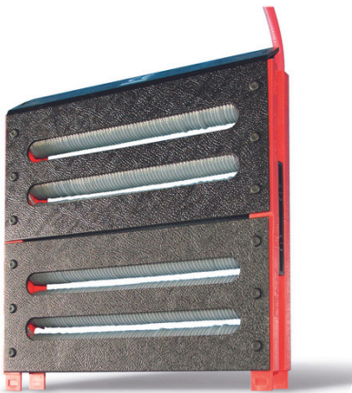
Polaris Modular Heater