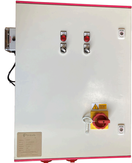
Braude Control Panel

Specialists in thermal process equipment for highly aggressive and corrosive liquids