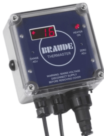
Thermaster Temperature Controller