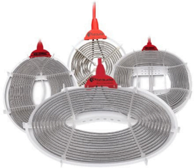
Polaris Popular range

The heater is thin enough to fit easily into confined spaces e.g. behind anode baskets.