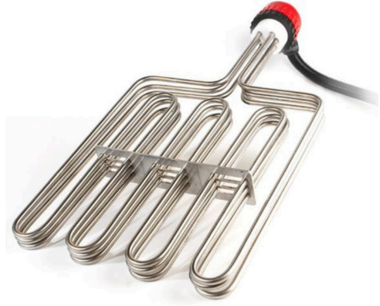
Polaris Popular range

The Polaris Neptune is particularly suited to custom tank configuration in less corrosive environments. Standard solution level should be at least 50mm above the hot zone of the heater and the heater would normally be mounted to the flange of the tank. Specify tank space when ordering for the first time.